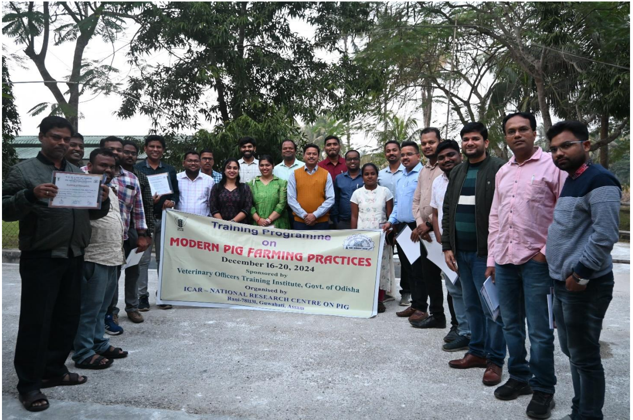
Group Photograph of Trainees with Course Coordinators during Valedictory Session