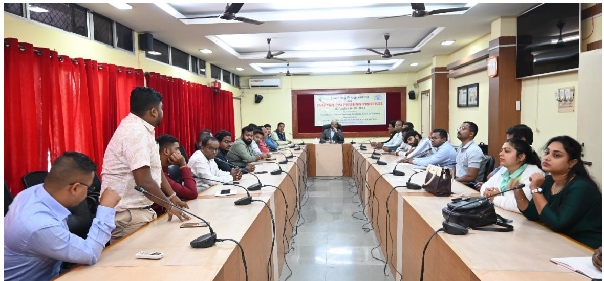
Interaction of Participants with the Director