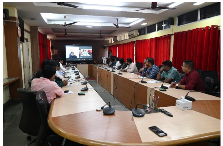
Lectures by Scientists on different aspects