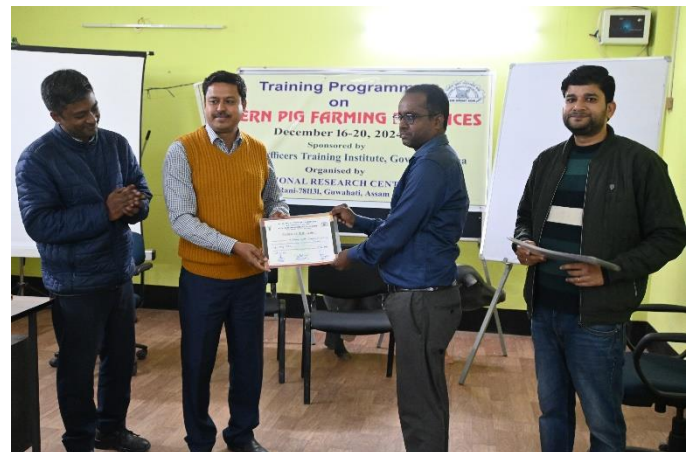
Certificate Distribution to Trainees